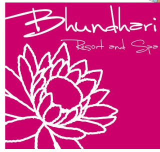
Bhundhari Resort & Spa “ The senses of Samui “