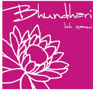
Bhundhari Koh Samui “Your fabulous holiday “