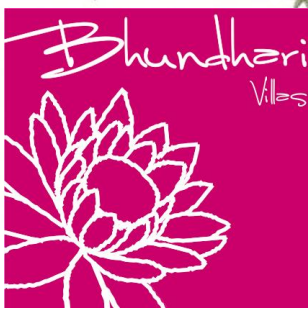
Bhundhari Villas “Samui Romance “